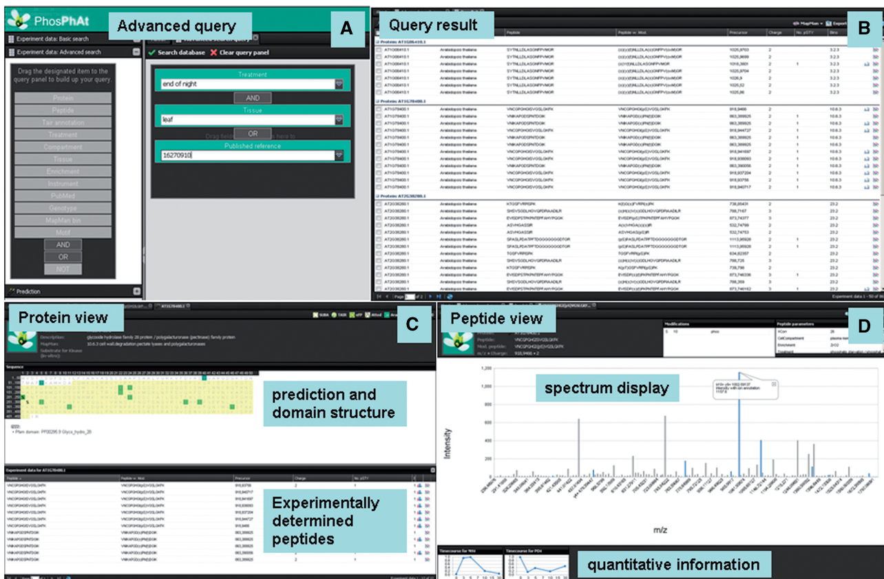
Figure 1. Screenshots of new PhosPhAt web interface. (A) Entry screen with advanced search, (B) result window, (C) peptide summary and (D) protein summary.

At the level of the query result summary, the user has the choice of hand-selecting peptides or of selecting all unique peptide sequences present in the query result. The output format is as 13-mers centered on the phosphorylated residue. Only clearly assigned phosphorylation sites (i.e. those annotated as pS, pT and pY) will be included. For multiply phosphorylated peptides, each phosphorylation site will result in export of a separate 13-mer sequence. It is also now possible to export PhosPhAt query results in a spreadsheet format. The spectra of individual phosphopeptides can also be exported as an image or in the mgf data format.